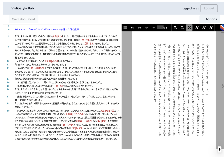
Figure 3 Current Vivliostyle Pub